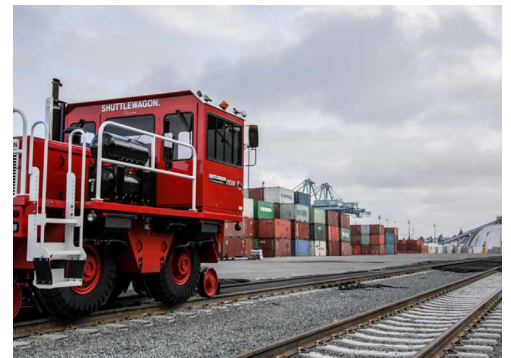
The railroad siding connection increased rail capacity by 60 cars, reducing mainline congestion.