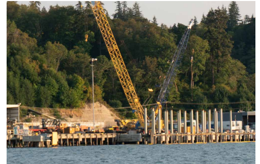
The South Terminal Wharf is being extended and strengthened to meet the next generation of shipping and cargo demands.

Call the Port of Everett's 24/7 Construction & Noise Hotline at 425.388.0269 or e-mail us at publicaffairs@portofeverett.com .